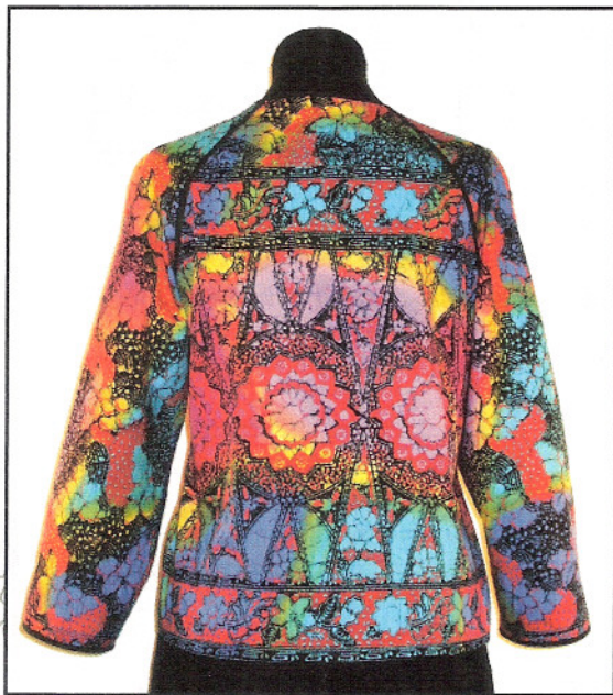
Back View of Border (Single) Fabric

Here is a picture of Soutache Cord so you will know what to look for - it will be with the trims.